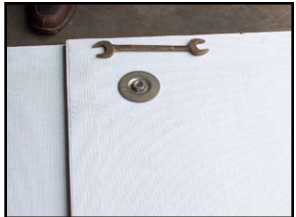
Step 12: Connection fixture is now installed.