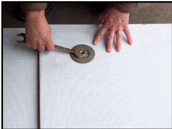
Step 11: Tighten nut using wrench until snug.