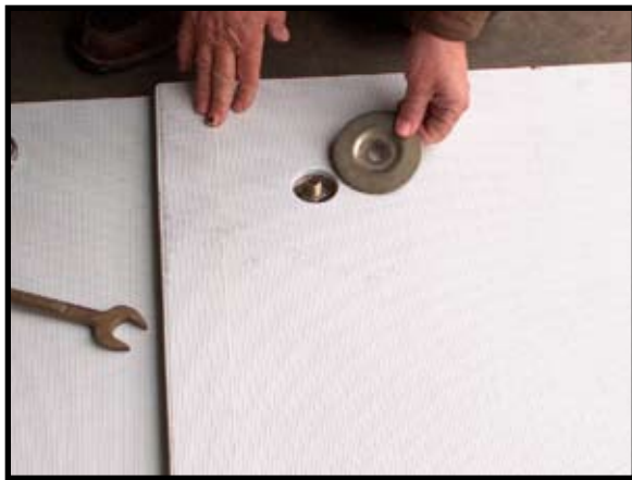
Step 9: Place dished washer over stud.