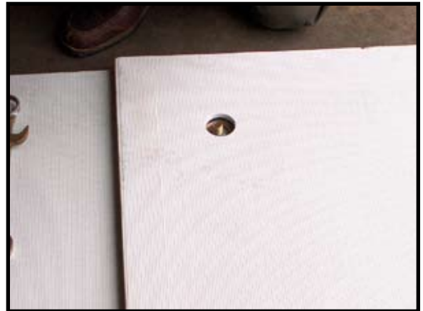
Step 8: Align stud in connector hole.