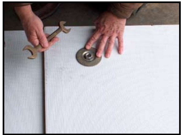
Step 10: Hand tighten nut on stud.